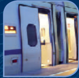
3 Outer/inner door