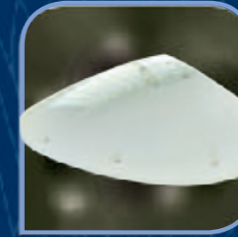
3 Air dam