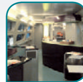
5 Kitchen and sanitary blocks