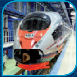
2 Carriage structure