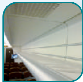
5 Luggage carrier