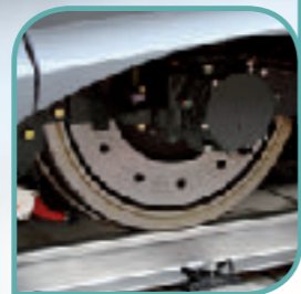
6 Brake system