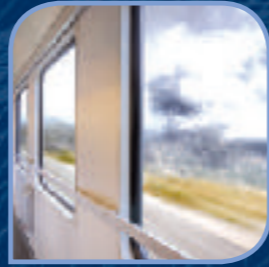
3 5 Window