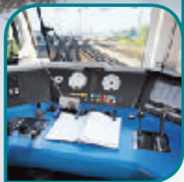
5 Driving cabin