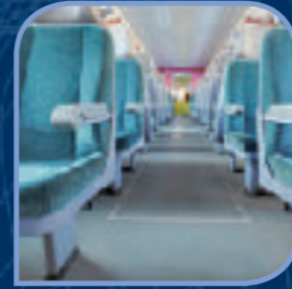
3 Floor coverings