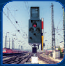
1 Trackside traffic control box Signal lights box